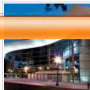
Taking Center Stage: D.C.