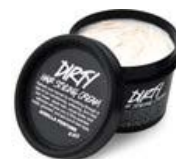
Dirty Hair Styling Cream $12.95 – Lush