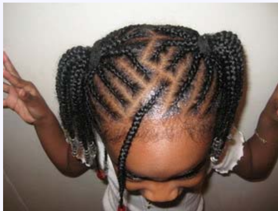
GOT MOISTURE, MOISTURE, MOISTURE? 😊

Great! Thanks for sharing your review. 😊